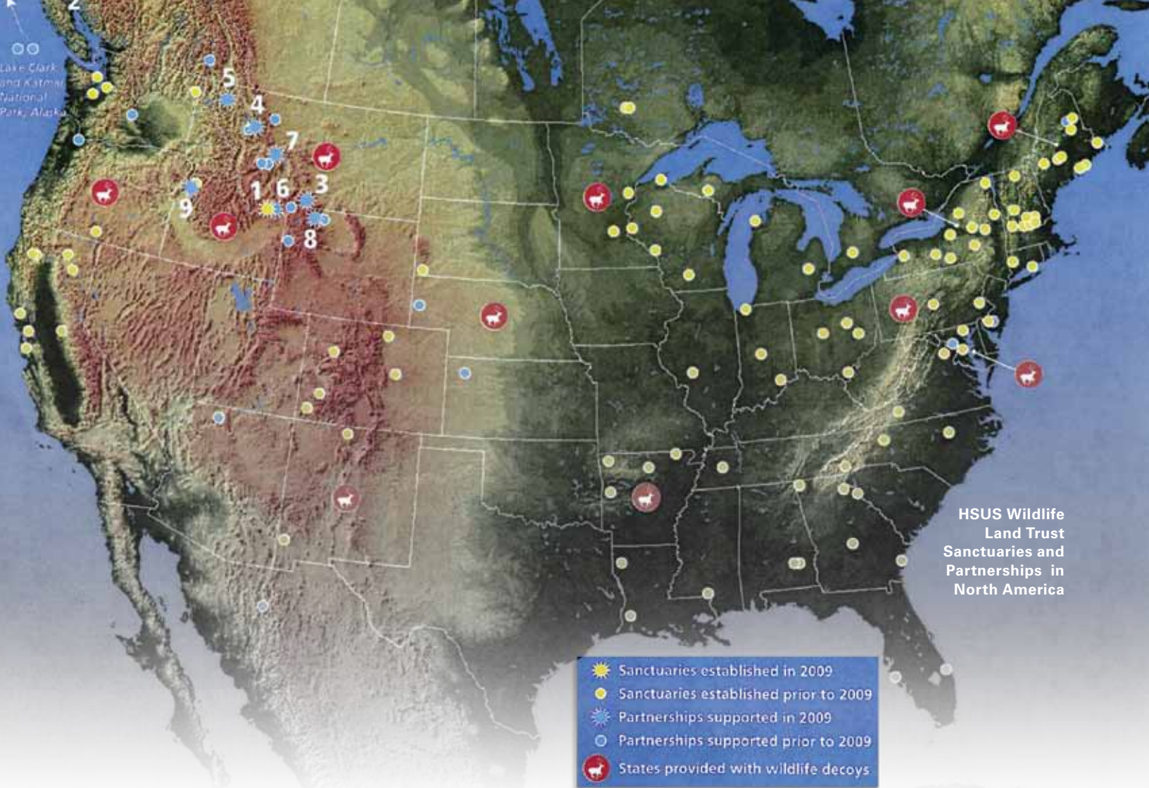
HSUS Wildlife Land Trust Sanctuaries and Partnerships in North America