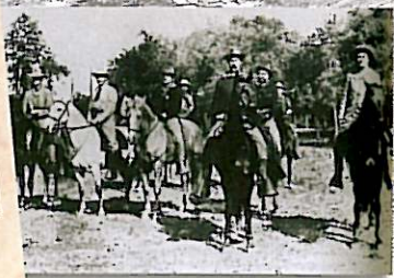
OTAMUS HUNT ON THE MACKENZIE RIVER